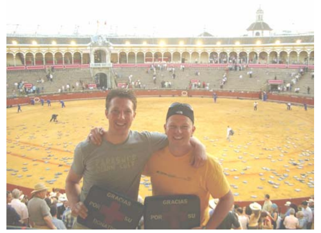
At the bullfight

Passing through Lisbon brought us to the Algarve. We arrived in Lagos, a small fishing village known by many travellers for its gorgeous coastline, relaxed atmosphere, and exciting social life. We stayed in a cozy hostel minutes from the beach that boasted a large central courtyard which promoted story sharing and other fun conversation among its residents. After the fast paced driving of the previous days, we easily warmed up to the idea of relaxing on the beach. We stayed there for the next five days. We could fill volumes with our great experiences in Lagos, it was the highlight of our trip.