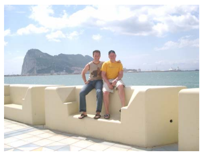
The Rock of Gibraltar

The 36-degree temperatures only added to the cultural experience before heading east to Marbella. It was here on the Costa del Sol that we soaked up the last of the Spanish sunshine between quick visits to Gibraltar, Algeciras, Granada, and Alicante before finishing our trip with a marathon 900 km drive back to Barcelona.