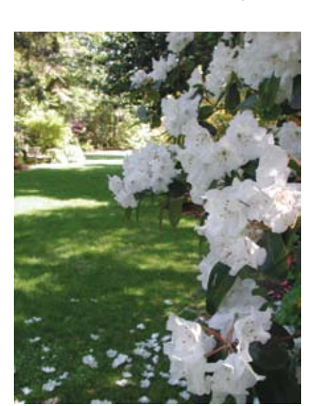
Rhodo puralbum.

At this time I would like to wish every one of you a happy holiday season and hope that 2008 will be a good year for you all.