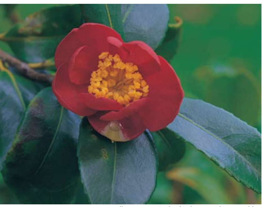
Camellia sasanqua 'Yuletide'