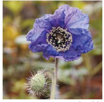
Meconopsis Pratti (horridula)

But the Meconopsis I like—as a foil to other shades of the oranges, yellows and reds in the garden, especially with azaleas, and which generate brightness amongst the greens of the ferns and rhododendrons—is the Meconopsis cambrica, which is a yellow, self sowing perennial and which practically becomes a ground cover in a few years! There are other colours in this family: white, pink, lavender, mauve and a pale yellow of M. pseudointegrifolia from