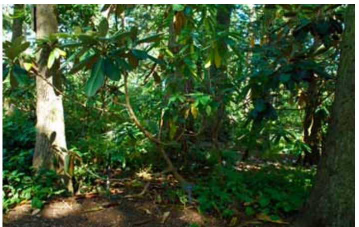
The rhodos in their new permanent home