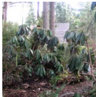
Large-leaved species tagged and ready for digging