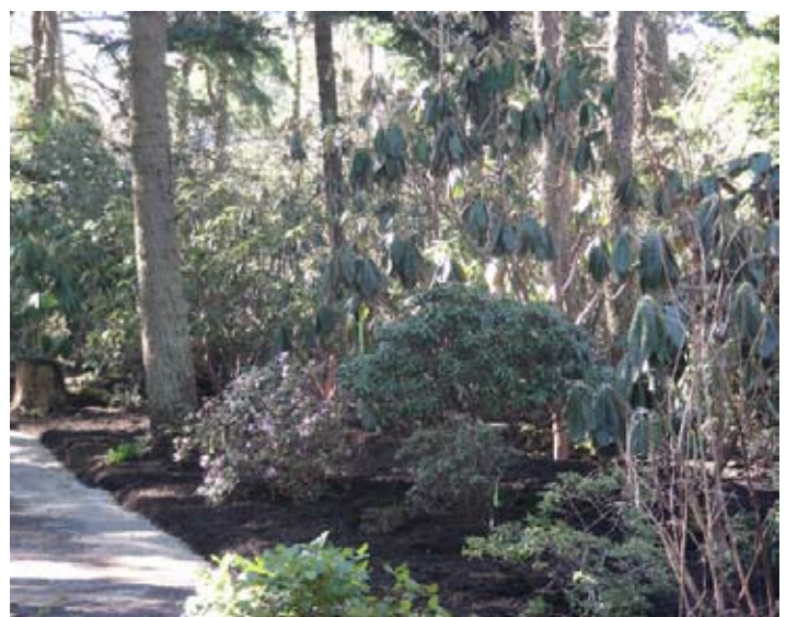
Transplanted rhodos in their new home at Finnerty Gardens