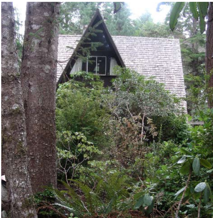
Kreiss house surrounded by rhododendrons

The criteria for selection involved rarity of a species, and size and health of the plants. Unfortunately, several of the large mature big leaved rhododendrons were deemed too difficult to move. Cutting material was taken from some of these plants in the hope that grafting could be done to perpetuate them. When the selection process was completed, the team tagged approximately 122 plants. Of these 80 are definitely identified