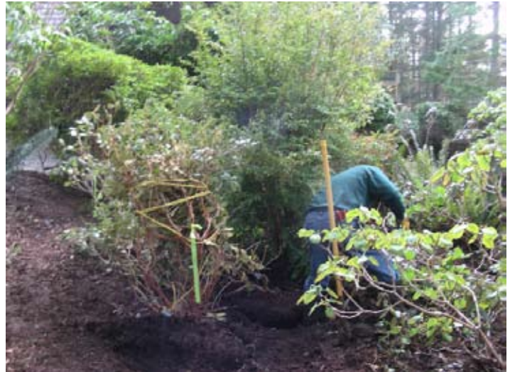
Preparing the rhodos for transplanting

A chronological record of the tagging, preparation and transplanting process by the hard-working gardeners and volunteers