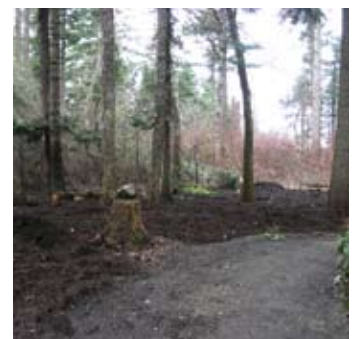
Newly-prepared bed ready for Kreiss collection