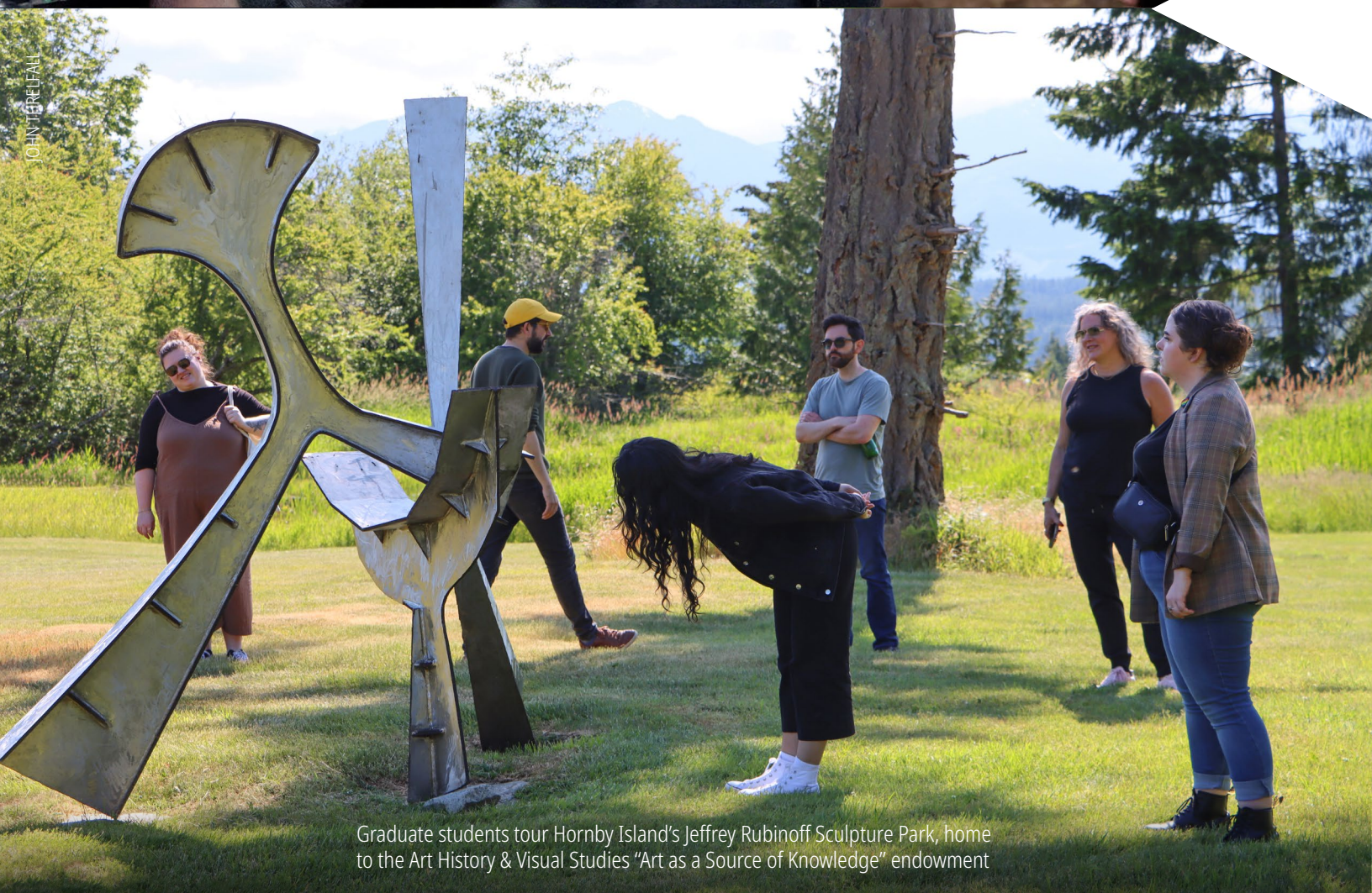
Graduate students tour Hornby Island's Jeffrey Rubinfeld Sculpture Park, home to the Art History & Visual Studies "Art as a Source of Knowledge" endowment