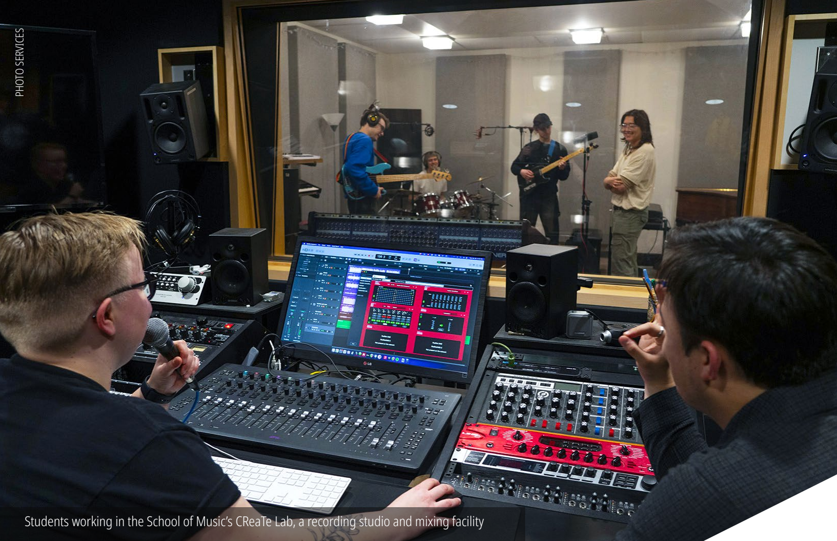
Students working in the School of Music's CReaTe Lab, a recording studio and mixing facility