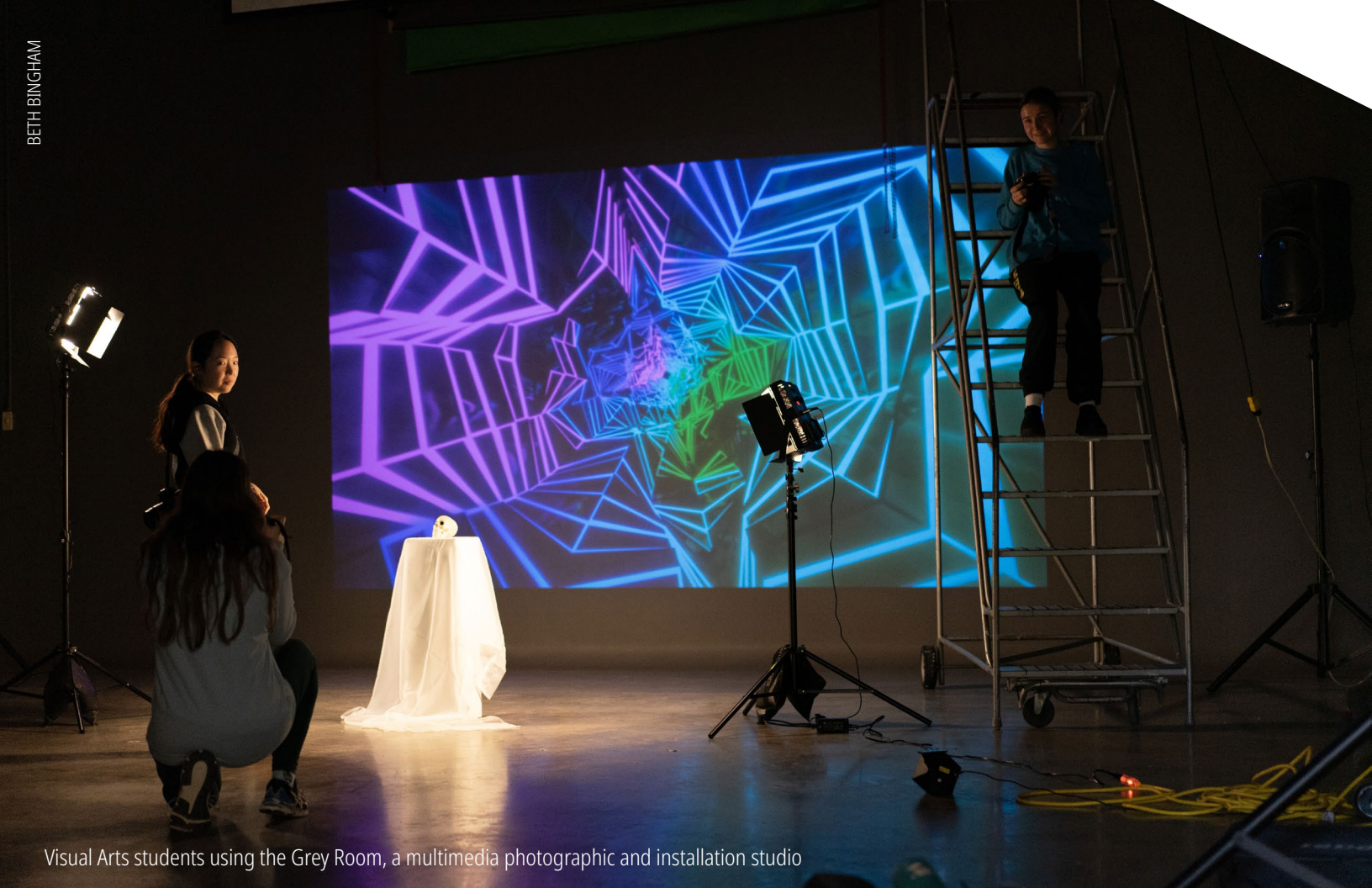
Visual Arts students using the Grey Room, a multimedia photographic and installation studio