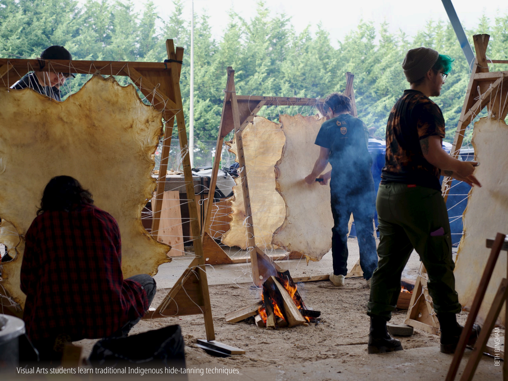
Visual Arts students learn traditional Indigenous hide-tanning techniques