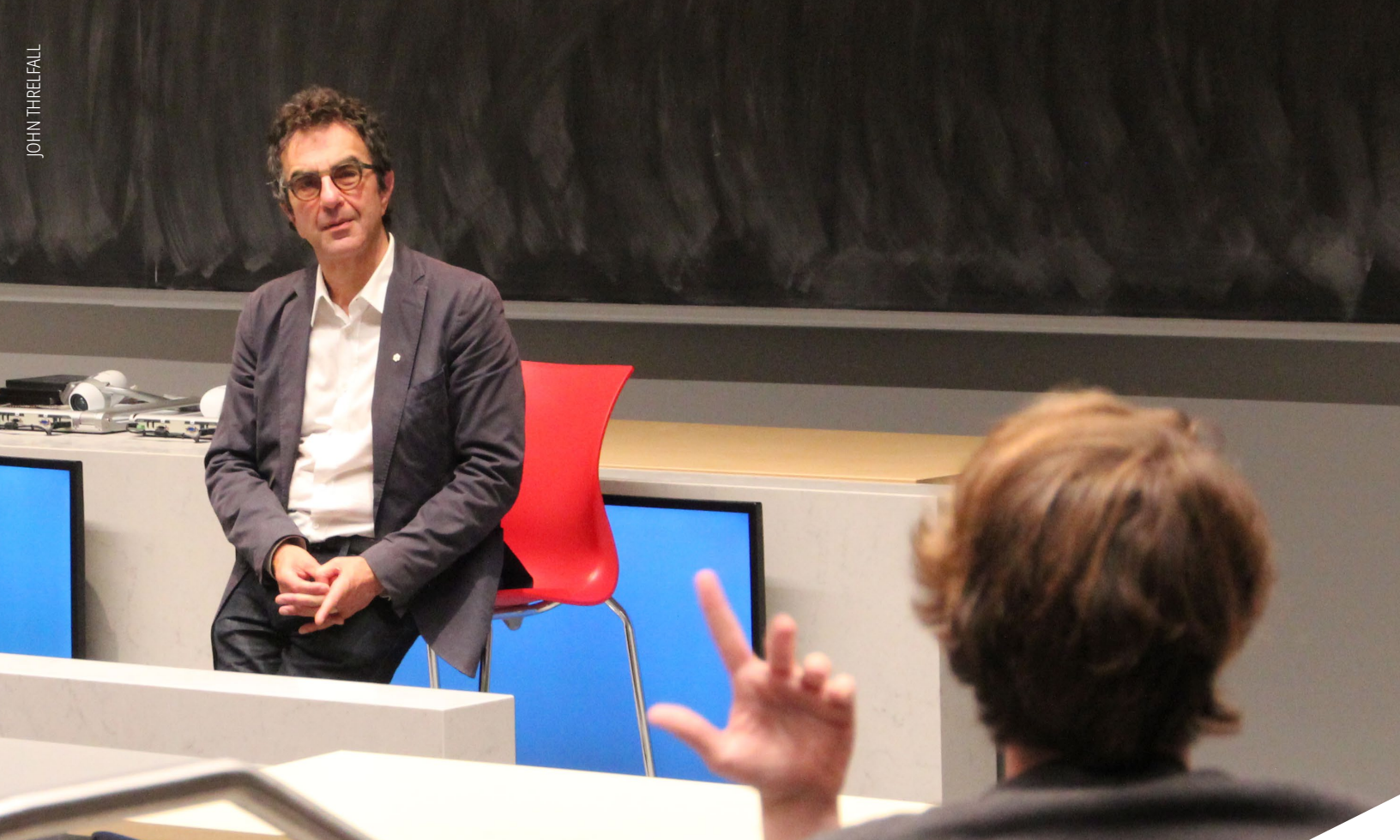
Award-winning filmmaker Atom Egoyan offers industry insights during a film studies class