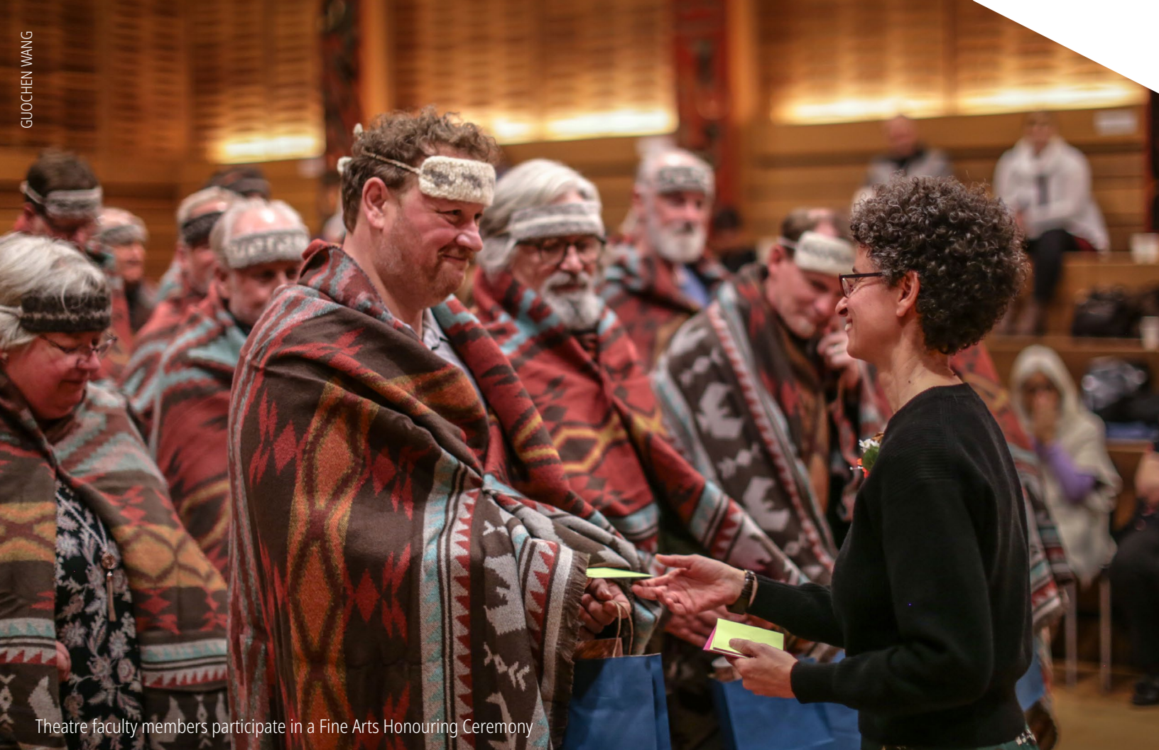
Theatre faculty members participate in a Fine Arts Honouring Ceremony