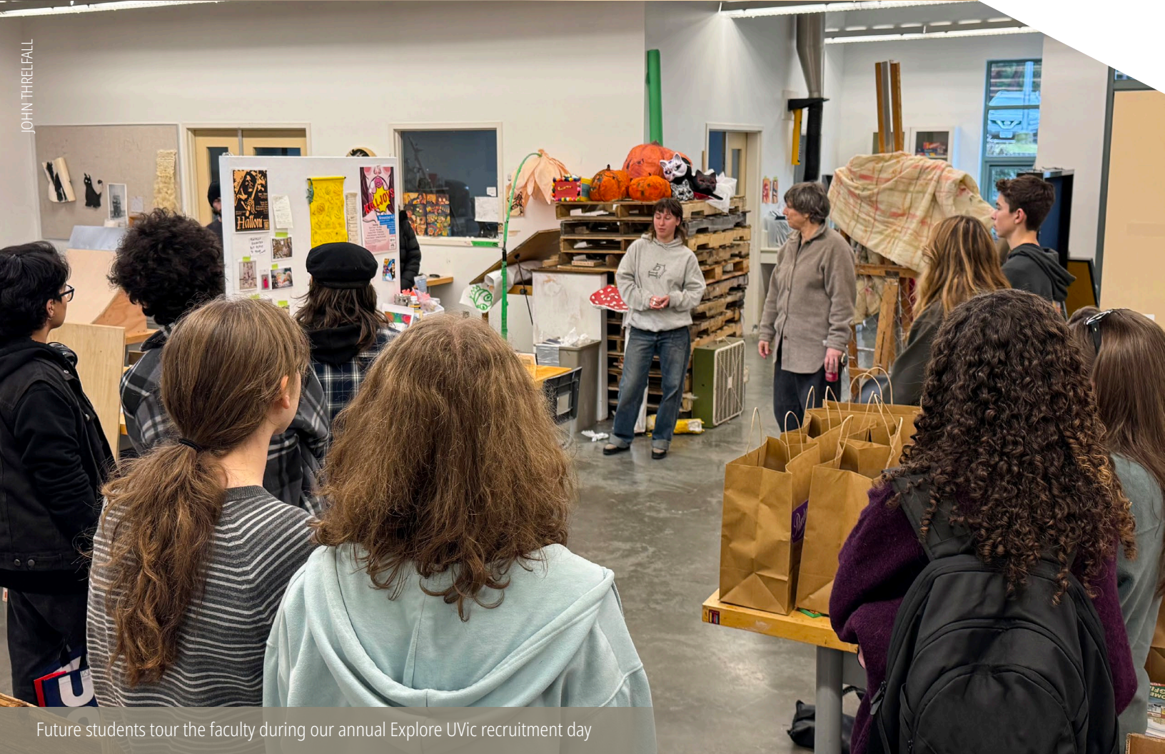
Future students tour the faculty during our annual Explore UVic recruitment day