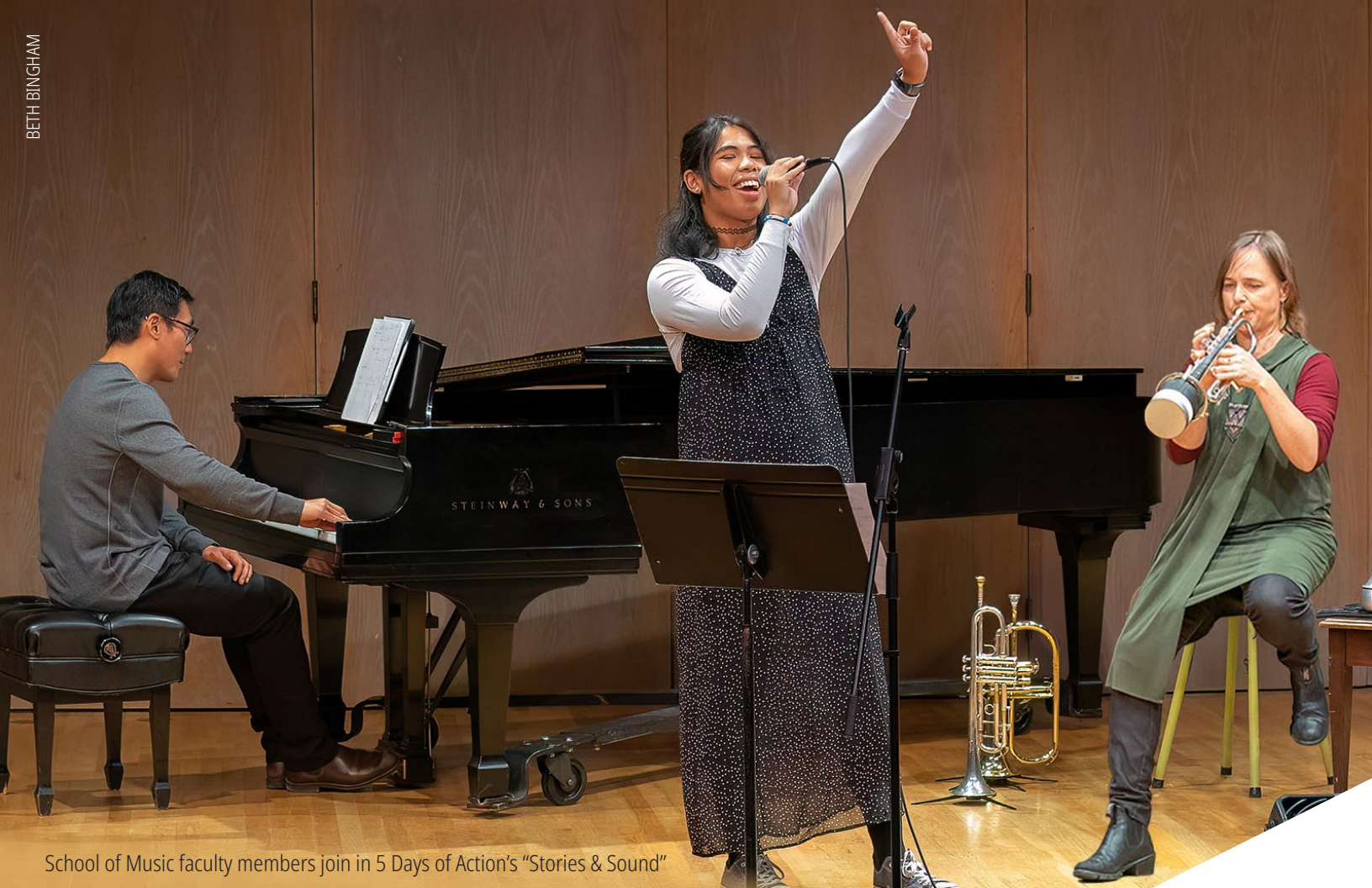
School of Music faculty members join in 5 Days of Action's "Stories & Sound"