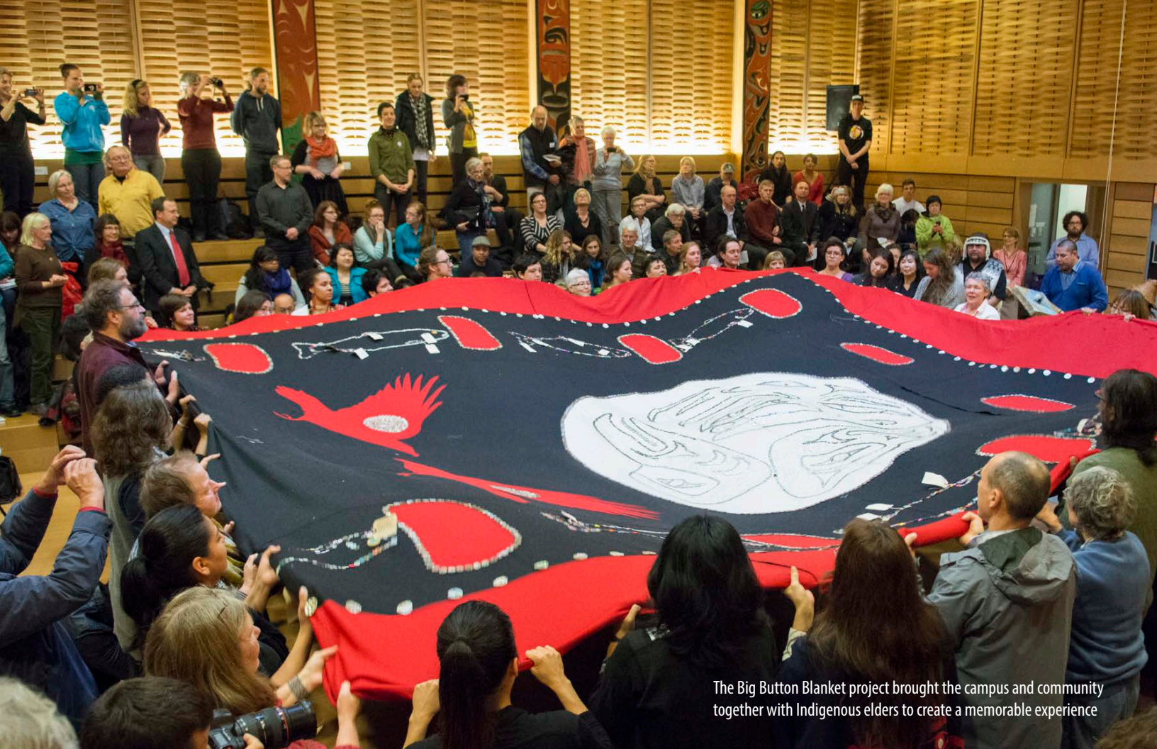
The Big Button Blanket project brought the campus and community together with Indigenous elders to create a memorable experience