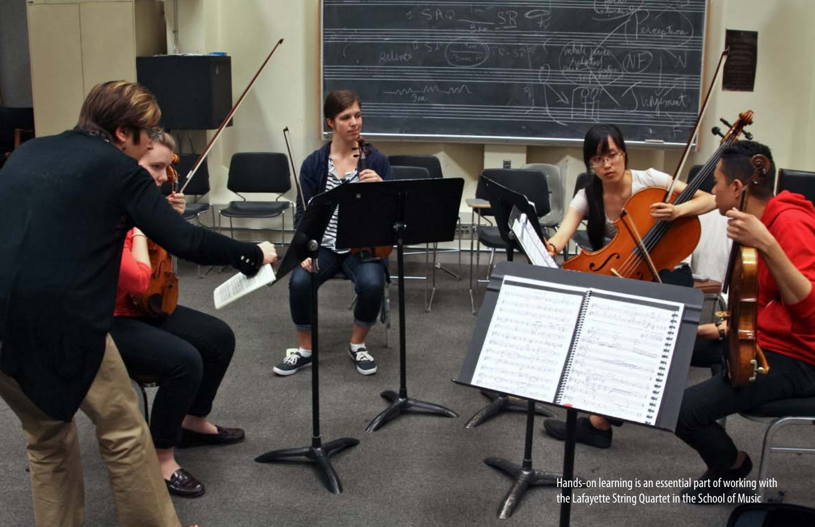
Hands-on learning is an essential part of working with the Lafayette String Quartet in the School of Music