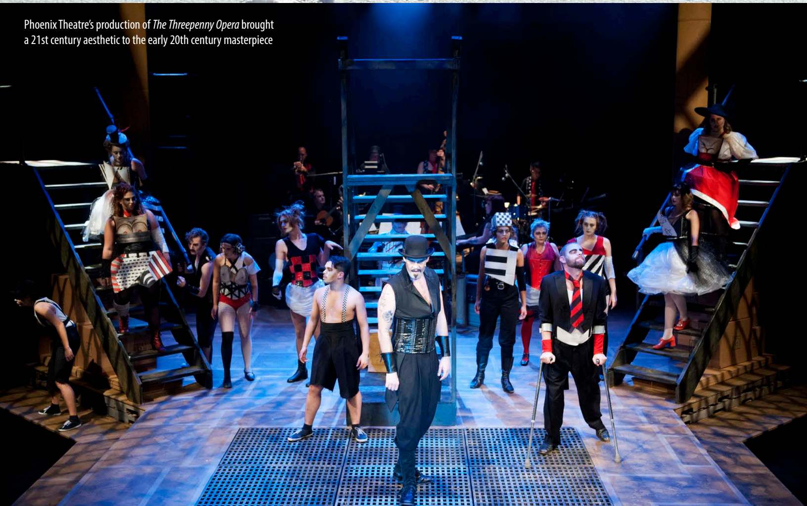
Phoenix Theatre's production of The Threepenny Opera brought a 21st century aesthetic to the early 20th century masterpiece