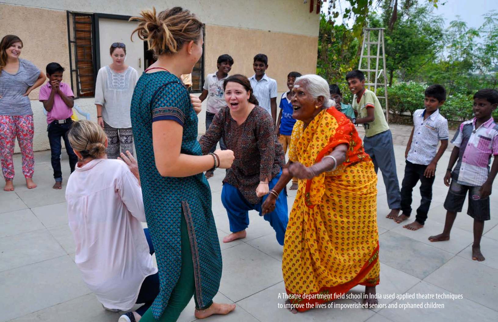
A Theatre department field school in India used applied theatre techniques to improve the lives of impoverished seniors and orphaned children