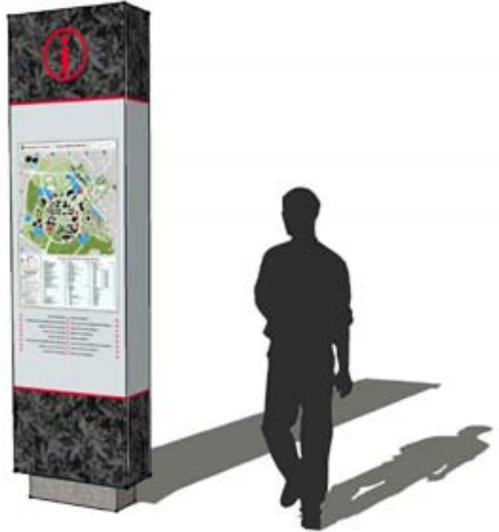
Major Directional [Sign 9]