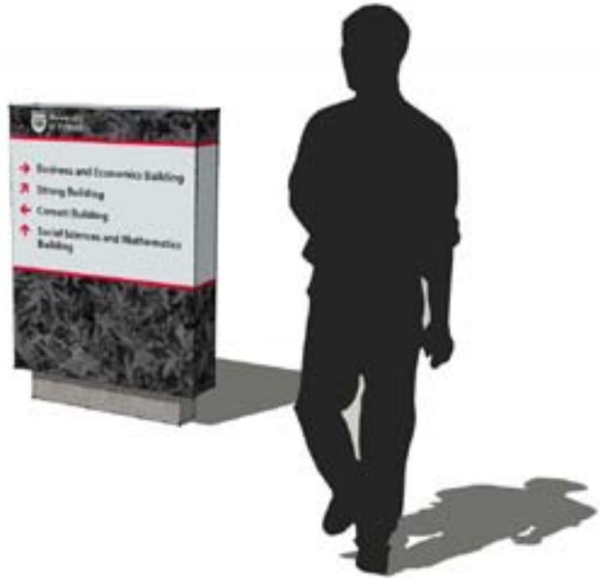
Intermediate Directional [Sign 10]