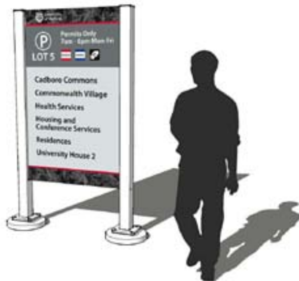
Parking Lot [Sign 2C]