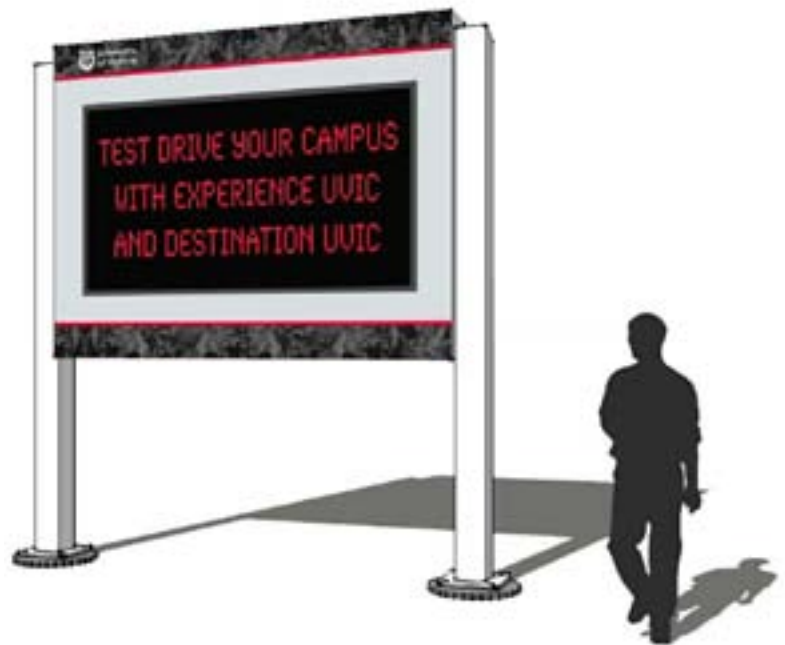
Digital Message Board [Sign 5]