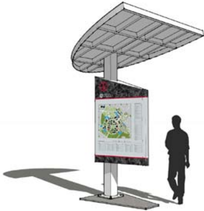
Map Directory Kiosk [Sign 8]