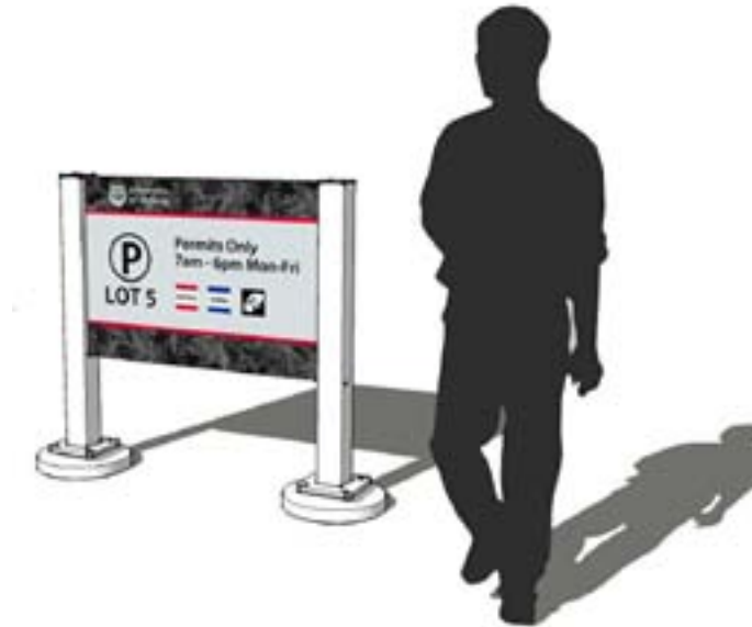
Parking Lot [Sign 2A]