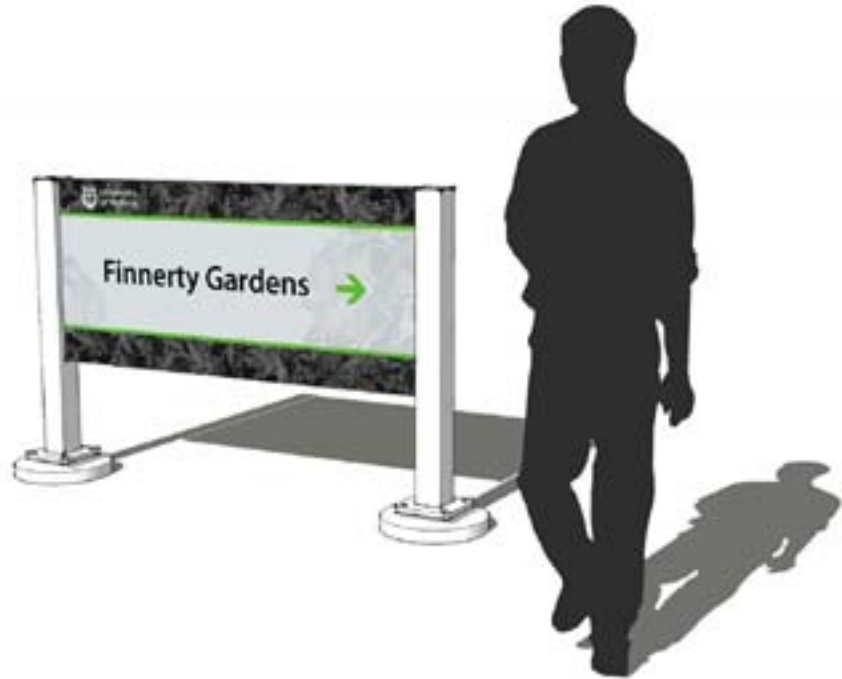
Green Space Identification [Sign 7]