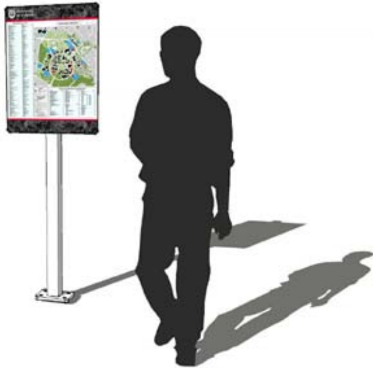
Minor Pedestrian Map [Sign 15]