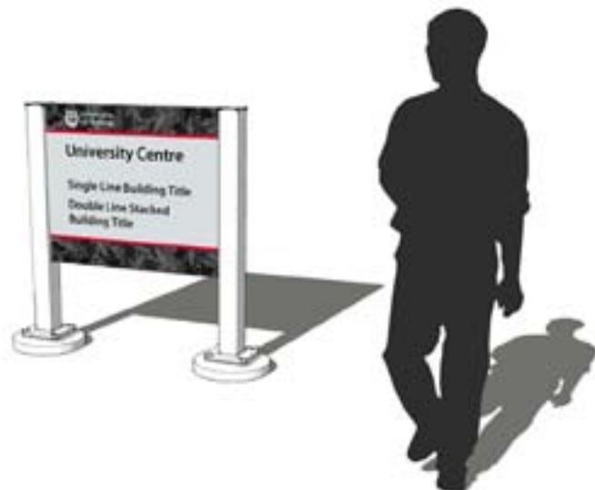
Building Identification [Sign 3B]