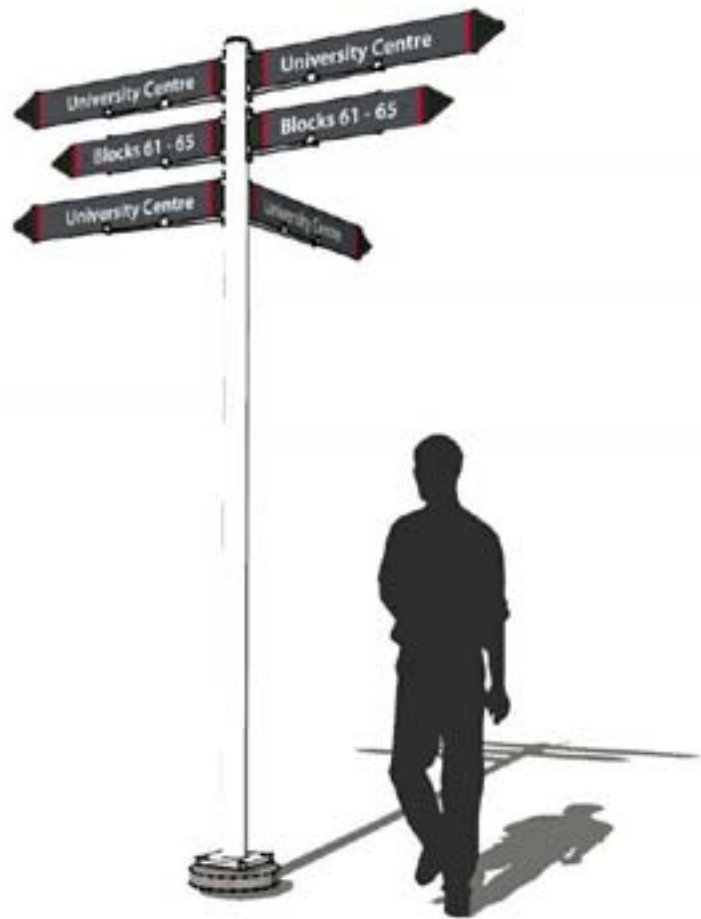
Street Blade [Sign 11]