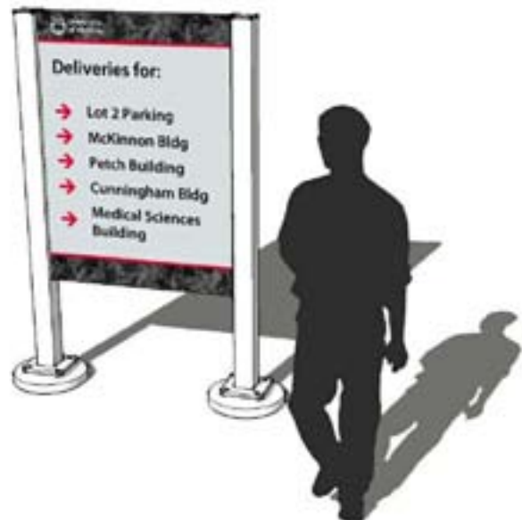
Directional [Sign 6B]