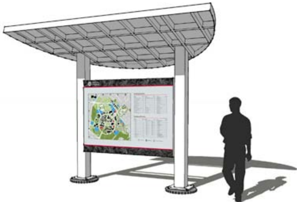
Map Directory Kiosk [Sign 4]