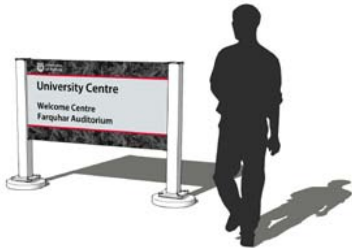
Building Identification [Sign 3A]