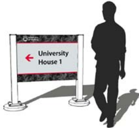
Building Identification [Sign 3B]