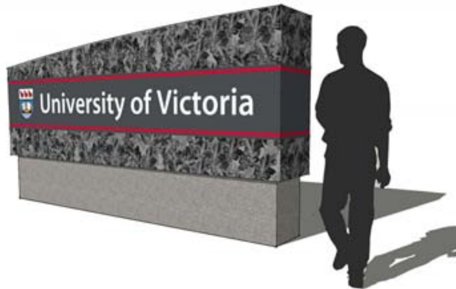
Main Gateway [Sign 1]