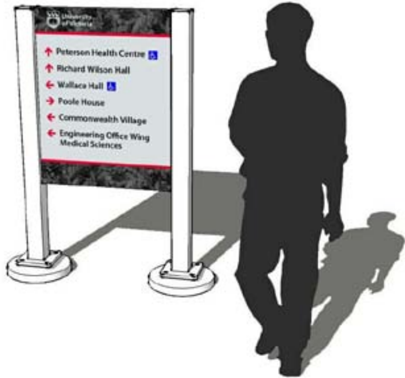
Minor Directional A [Sign 12]