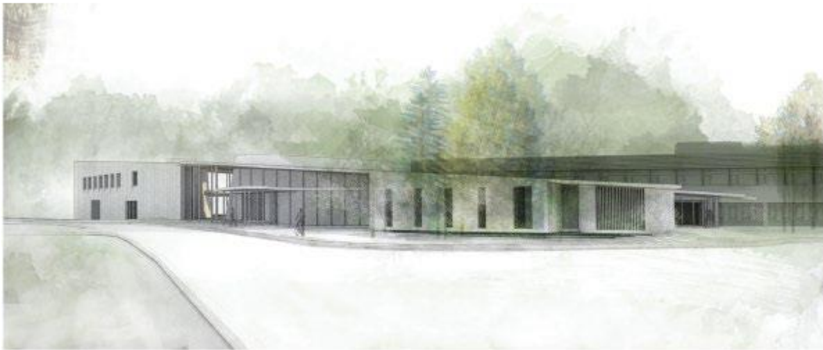
View from the Ring Road