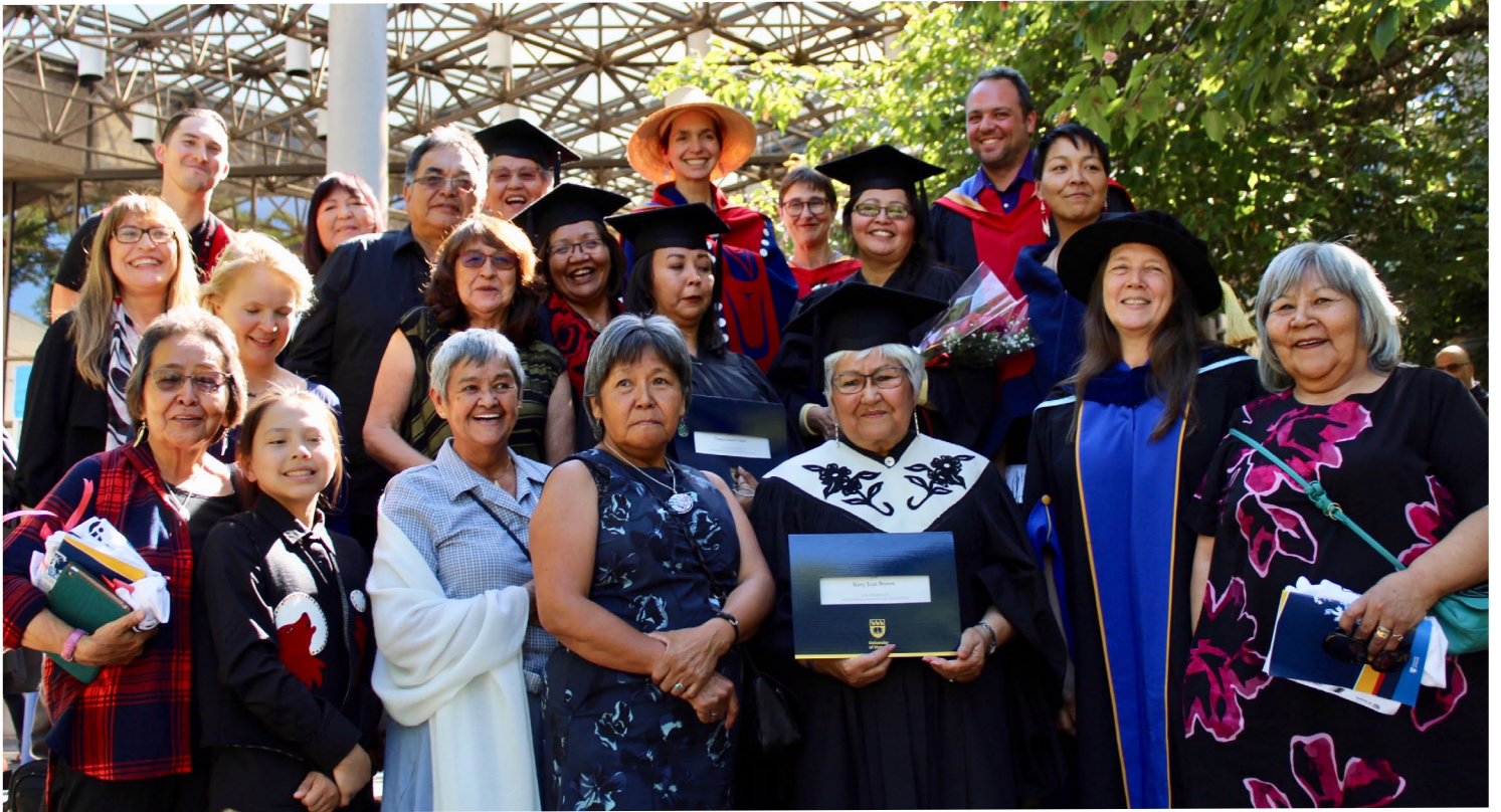
Members of the Tāltān language cohort were surrounded by family, mentors, and Tāltān leaders at their graduation. Graduates crossed the stage at Farquhar Auditorium to receive their degrees at UVic's Convocation Ceremony on June 10, 2019.