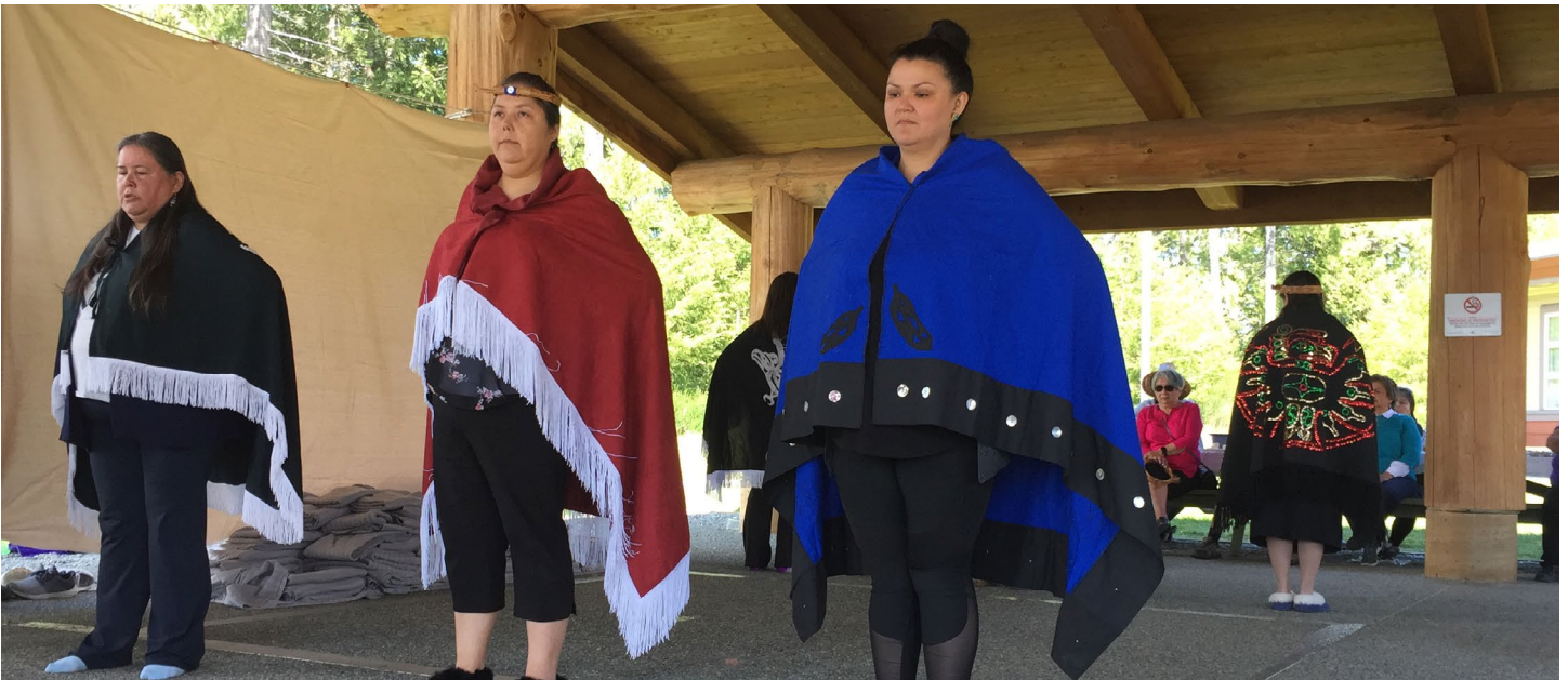
In this photo: Nuuchaanuł students performing the dance and song they created in their courses.

The largest cohort of diploma students in Indigenous Education has been exercising their immersion muscles lately. Local Nuuchaanuł instructors and fluent elder speakers worked with the cohort, in community contexts this summer to deliver courses in the Nuuchaanuł language. Students were challenged to put down their pens and papers and listen very deeply in the traditional Nuuchaanuł way. The courses were beautifully taught and received, and brought together many parts of past courses and teachings, including the dance and song composed over two past courses. This traditional way of learning and thinking will inform students as they prepare to embark on their final pieces of the diploma program, specifically the practicum in the fall. Students will be placed in many different contexts and communities, and will have an opportunity to teach and learn in preparation for whatever lies ahead in their language revitalization journeys.