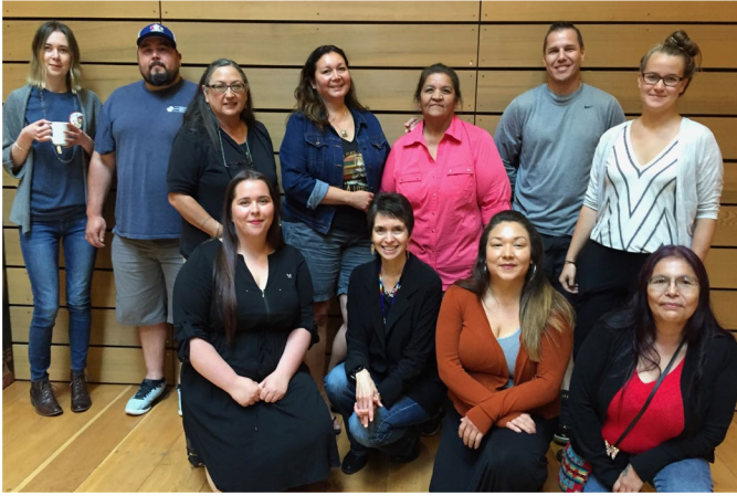
In this photo: MILR cohort gather for summer intensive studies.