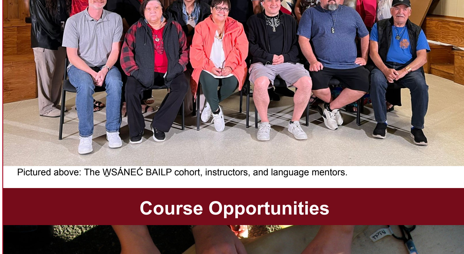
Pictured above: The WSÁNEĆ BAILP cohort, instructors, and language mentors.

We are grateful for this inspiring collaboration and the shared pursuit of language freedom.