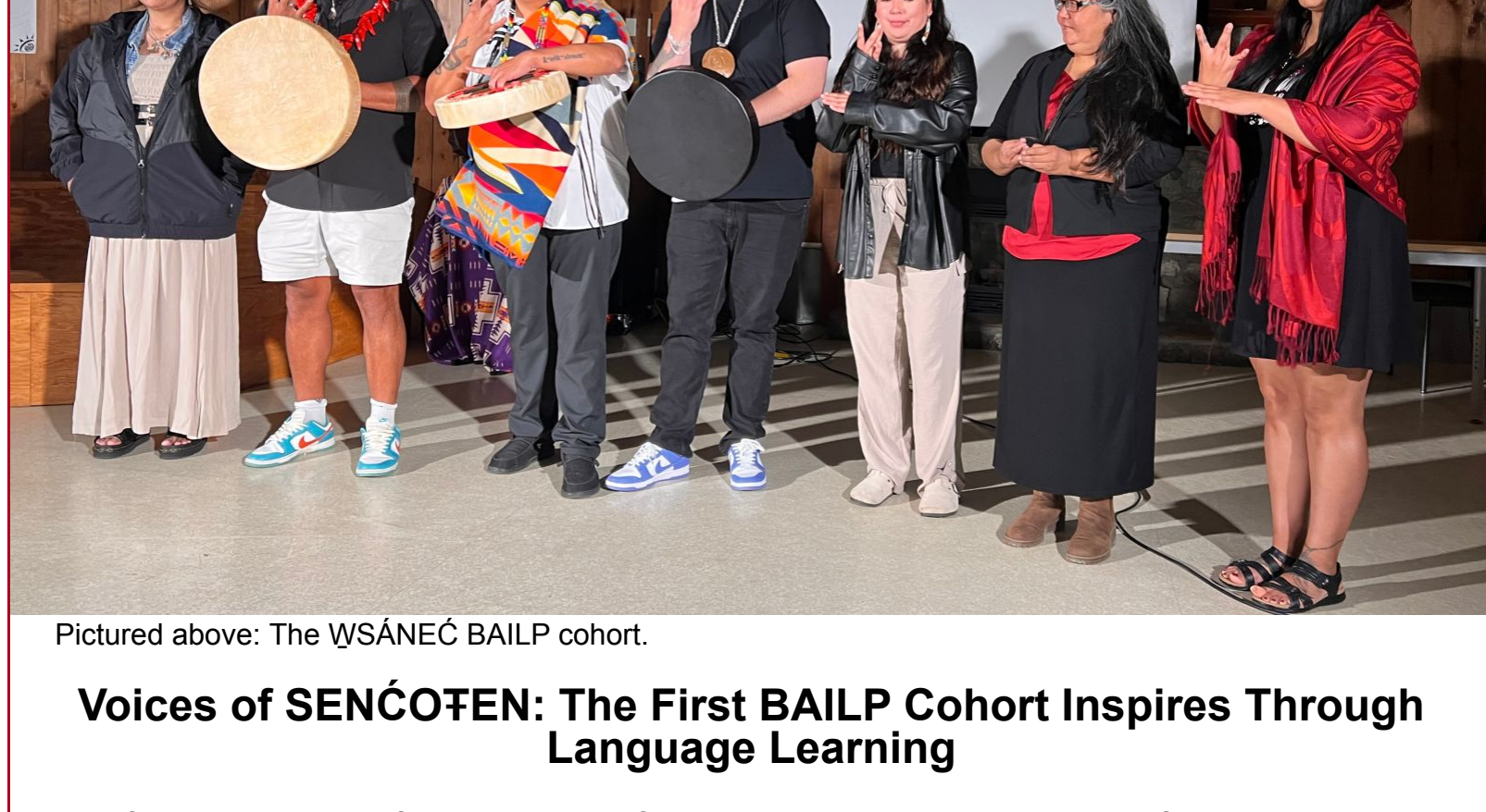
Pictured above: The WSÁNEĆ BAILP cohort.