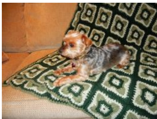
Figure 3. Dad's blanket

In Chapter Łēnt'e (4), I presented the data analysis and interpretation of the co-researchers transcribed visits in the form of an endodēsdił, to honour and give voice to the co-researchers' experiences. My inspiration for the organization of Chapter Łēnt'e (4): K'asba'e T'oh Dischā 33 was a crocheted family heirloom blanket (see Figure 3). This crocheted blanket symbolizes the collective voice of my co-researchers and myself. Each crocheted square represents an endodēsdił which I arranged according to size and colour (main theme and subthemes) and joined with new yarn (postscripts). The postscripts are thematic discussions of the esdahūhedeč.