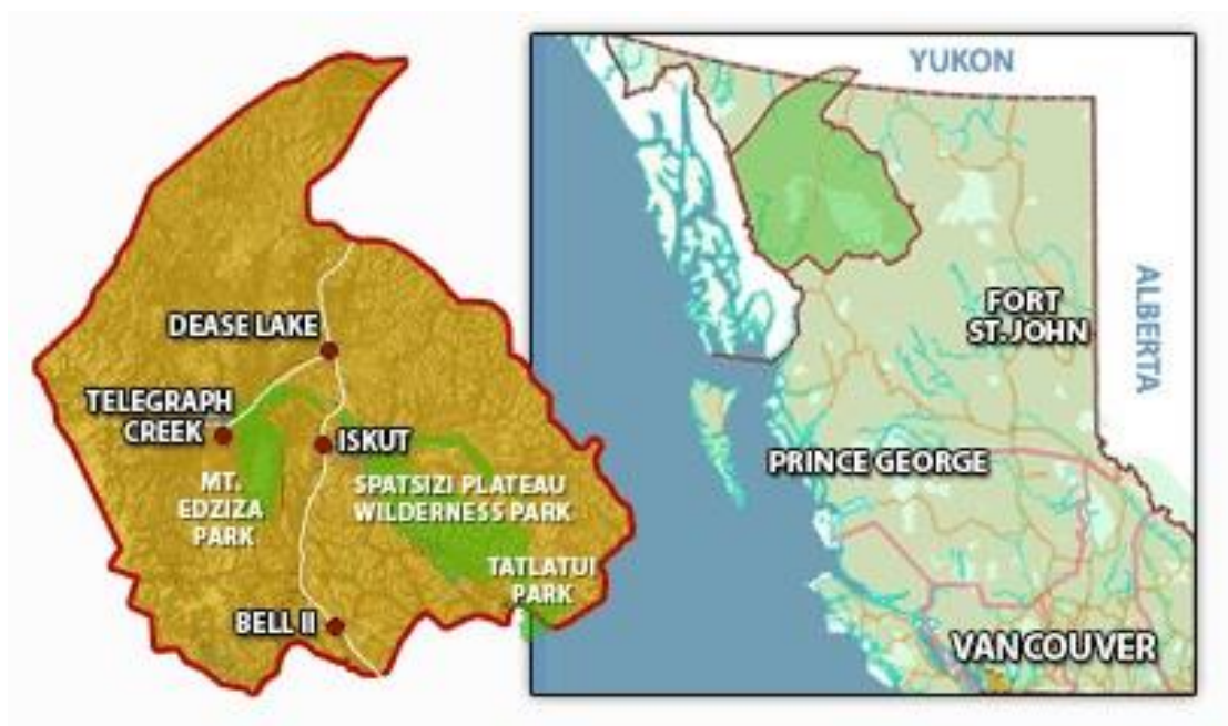
Figure 1. Map of Tahltan territory