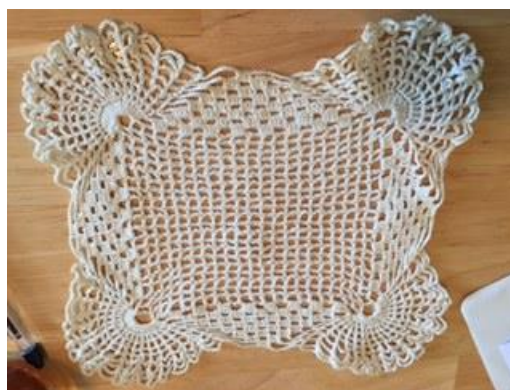
Figure 2. First crocheted doily

spend quality time with my grandmothers. My grandmothers were natural teachers who made me feel special and capable of learning.