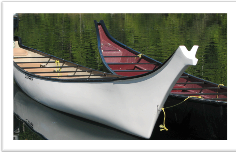
Figure 2: A modern Nuu-chah-nulth čapac.