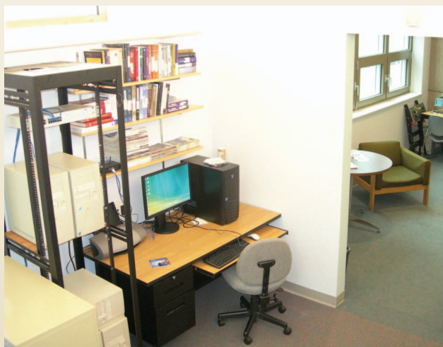
Inside the McNaughton Learning Centre.