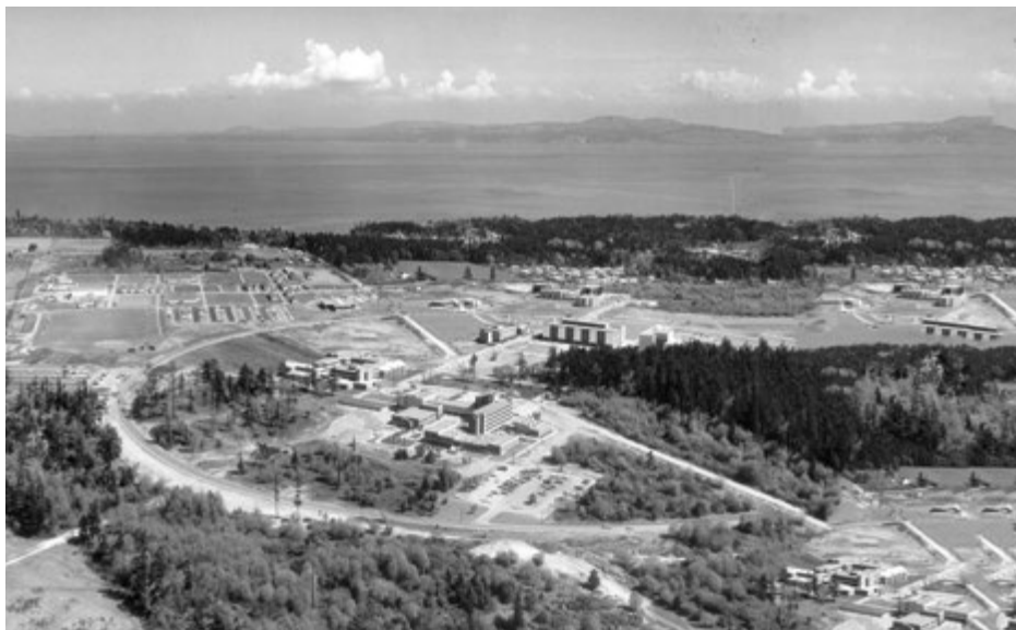
UVic Campus, 1967

The open book and the arm holding a torch aloft symbolize learning, and the three red martlets are borrowed from the McGill University coat of arms. Above the torch are the Hebrew words for "Let there be light," while the Latin below the shield translates as "A multitude of the wise is the health of the world."