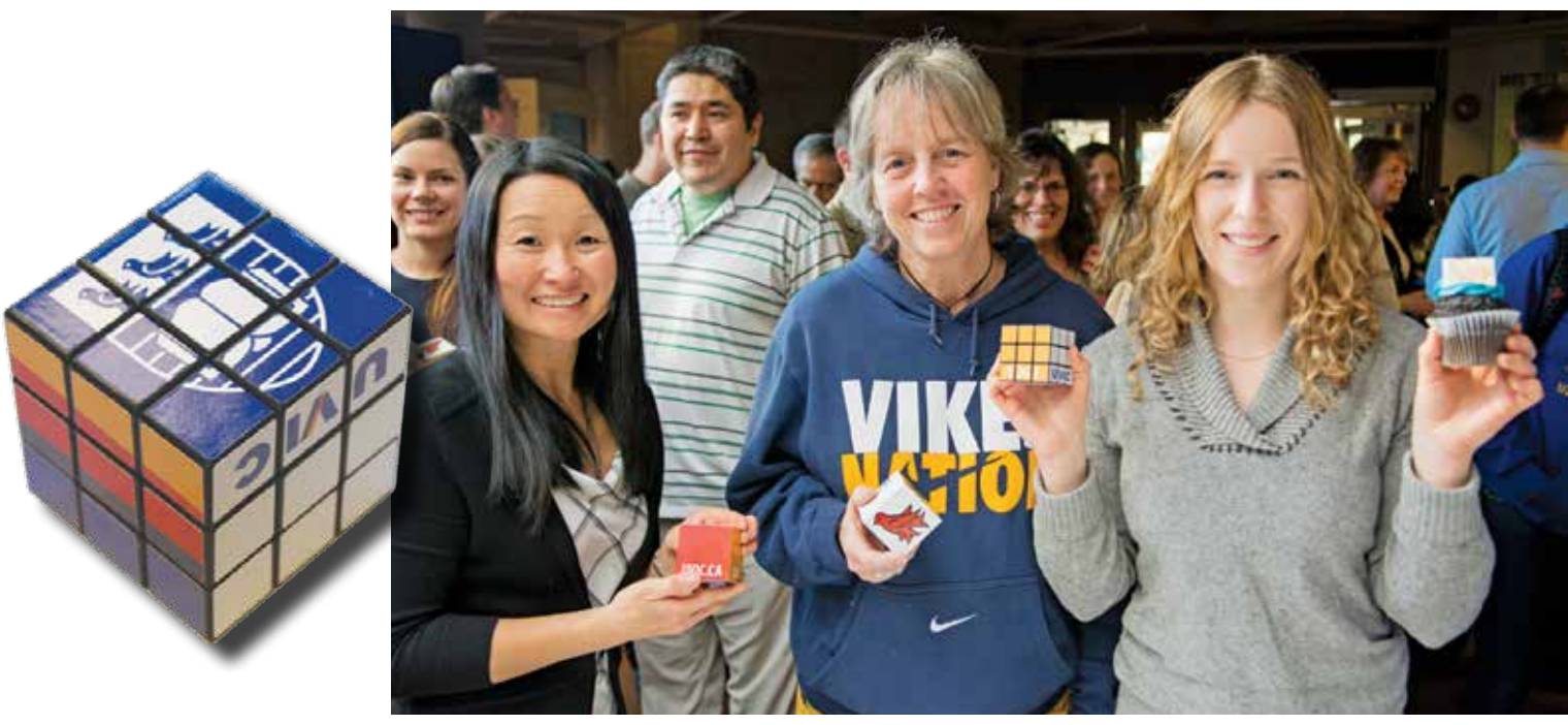
Cupcakes and Rubik's cubes added to the celebratory atmosphere.