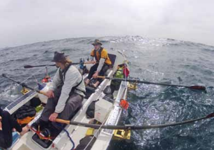
On an earlier row around Vancouver Island.