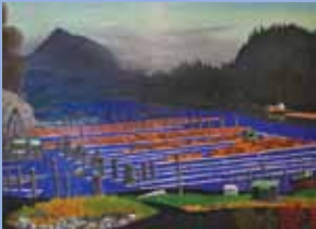
“View from the old coal dump, Ladysmith” E.J. Hughes, 1970