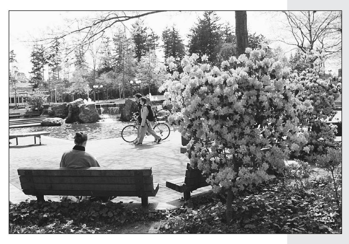
Known for excellence in teaching, research, and service to the community, the University of Victoria serves over 20,000 students. It is favoured by its location on Canada's spectacular west coast, in the capital of British Columbia.