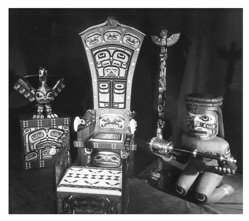
The University of Victoria acknowledges with respect the history, customs and culture of the Coast Salish and Straits Salish peoples on whose traditional lands the university resides.