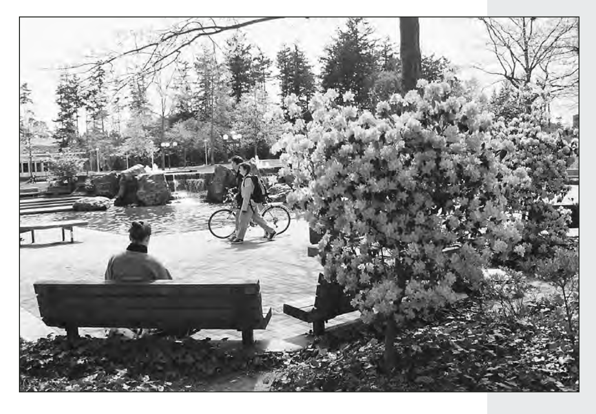
Known for excellence in teaching, research, and service to the community, the University of Victoria serves over 20,000 students. It is favoured by its location on Canada's spectacular west coast, in the capital of British Columbia.