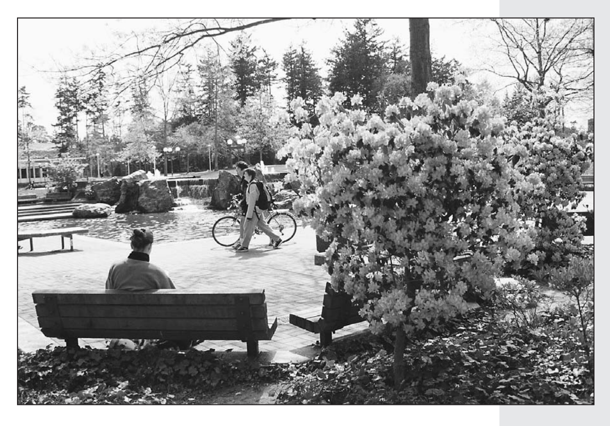
Known for excellence in teaching, research, and service to the community, the University of Victoria serves over 19,000 students. It is favoured by its location on Canada's spectacular west coast, in the capital of British Columbia.