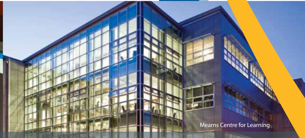
Mearns Centre for Learning