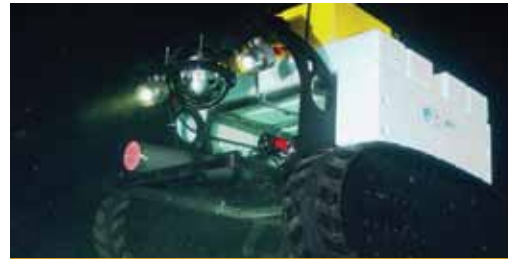
NEPTUNE Canada's "Wally", the world's first internet operated deep-sea crawler, will help researchers measure conditions at the sea floor.

Learn more at www.venus.uvic.ca and www.neptunecanada.ca .