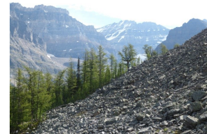
Sub-alpine larch in the Canadian Rockies