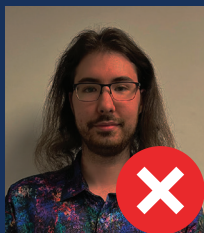
Image too dark