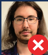
Image too closely cropped