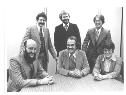
COACH Founding Board Meeting, Toronto, 1975