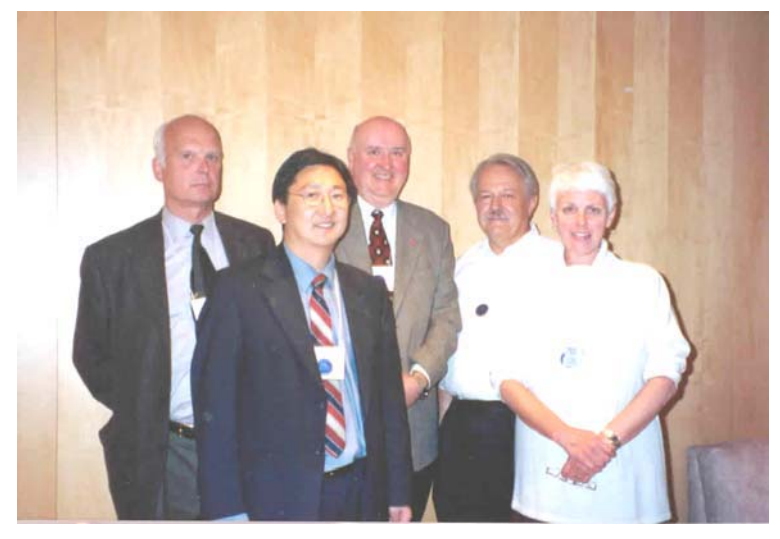
Current HINF faculty