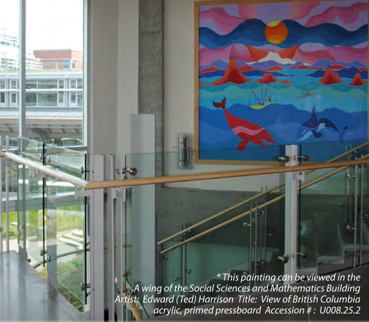
* This painting can be viewed in the -A wing of the Social Sciences and Mathematics Building Artist: Edward (Ted) Harrison Title: View of British Columbia acrylic, primed pressboard Accession #: U008.25.2