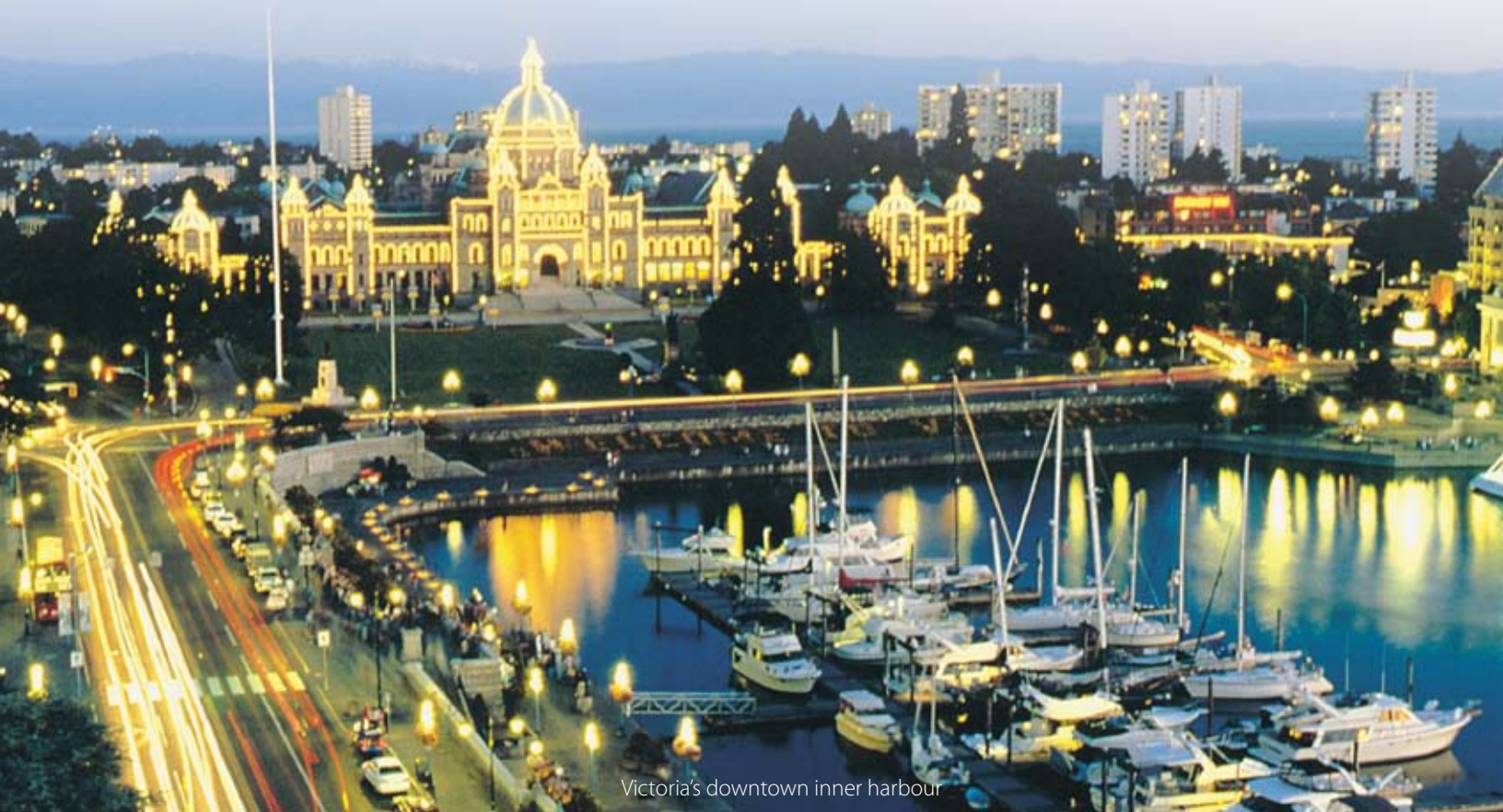
Victoria's downtown inner harbour

Victoria is BC's capital city and is world-renowned as a vacation destination. This city of 345,000 boasts a comprehensive public transit system, a safe and friendly atmosphere, and easy access to amazing shops and dining. It's easy for international students feel at home in Victoria and on the island!